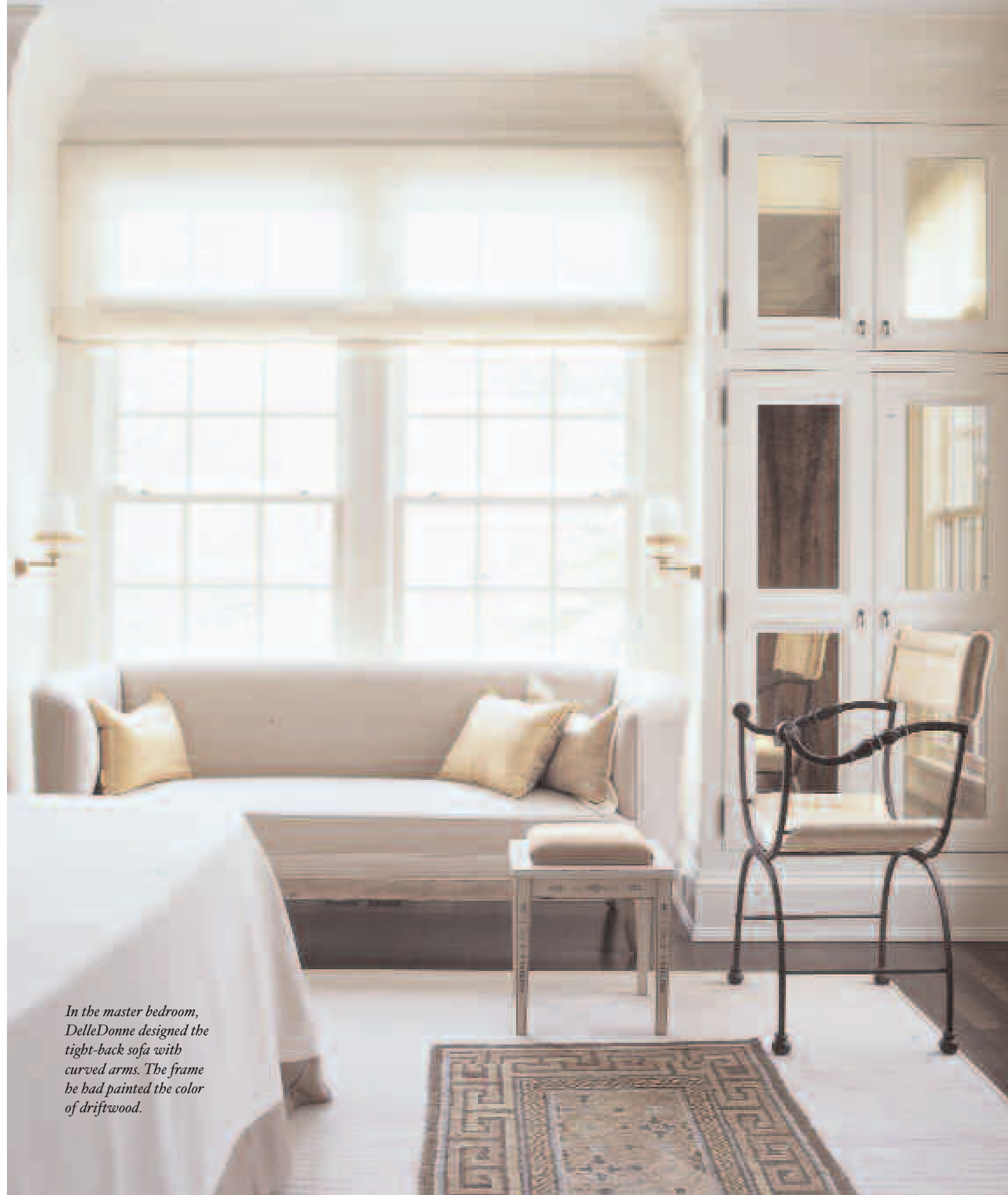
In the master bedroom, DelleDonne designed the tight-back sofa with curved arms. The frame he had painted the color of driftwood.

By KATHLEEN NICHOLSON WEBBER