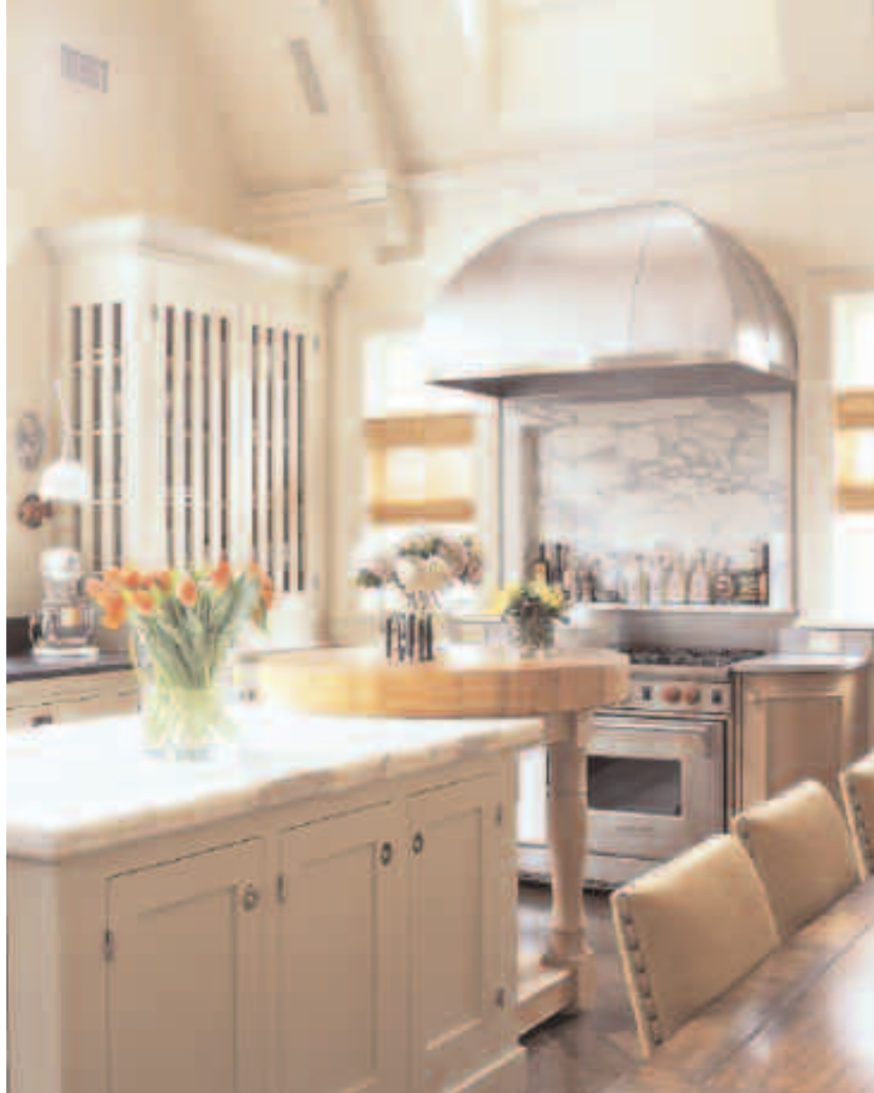
LEFT: The oversized stainless steel hood commands attention in this eclectic kitchen. The circular chopping block is best suited for the tall cook. Calcutta marble is on the island and backsplash and the slat-front cabinets are DelleDonne's custom design. BELOW: A peek into the dining area, through the Moroccan style doorway, reveals a hand-painted table top on an antique base. The French plates he calls great all texture. OPPOSITE PAGE: The grand kitchen features DelleDonne's custom designed millwork.