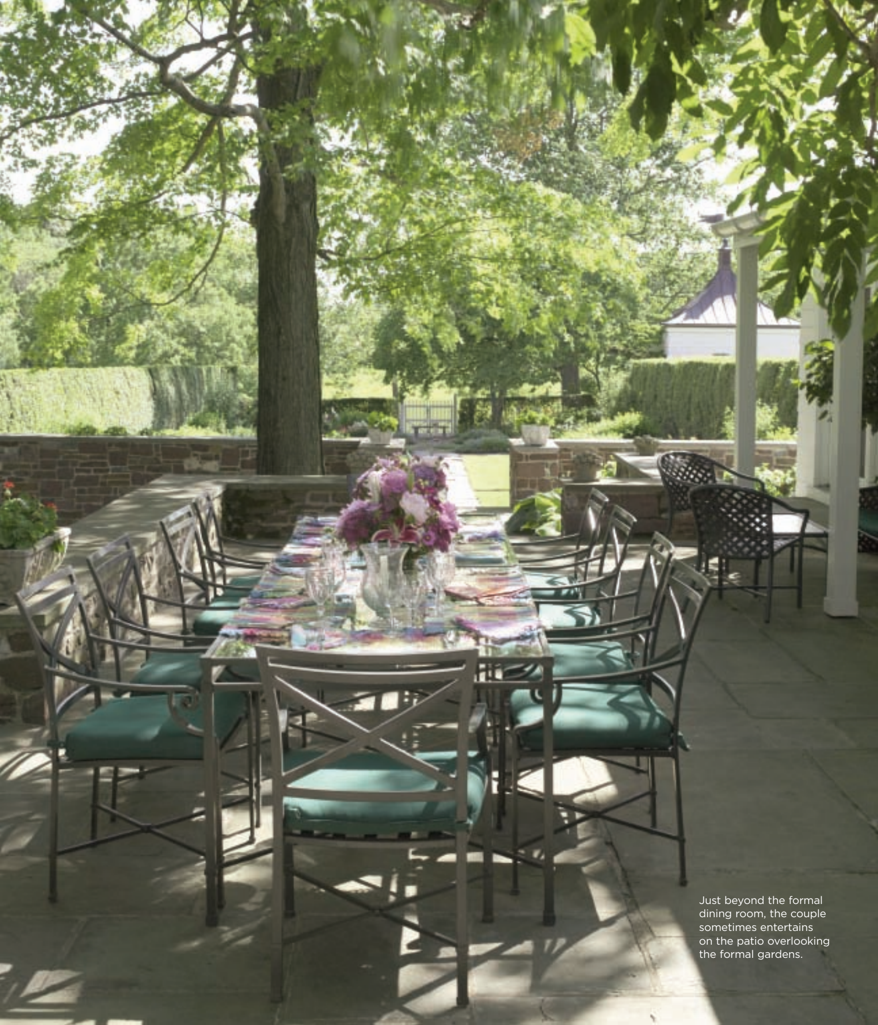
Just beyond the formal dining room, the couple sometimes entertains on the patio overlooking the formal gardens.